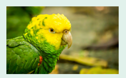
The Yellow-Headed Amazon, a threatened native parrot.